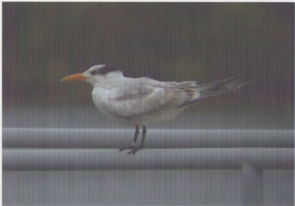
Royal TERN 364-01-2004 Peace Valley Park, Berks Co, PA 9/29/04